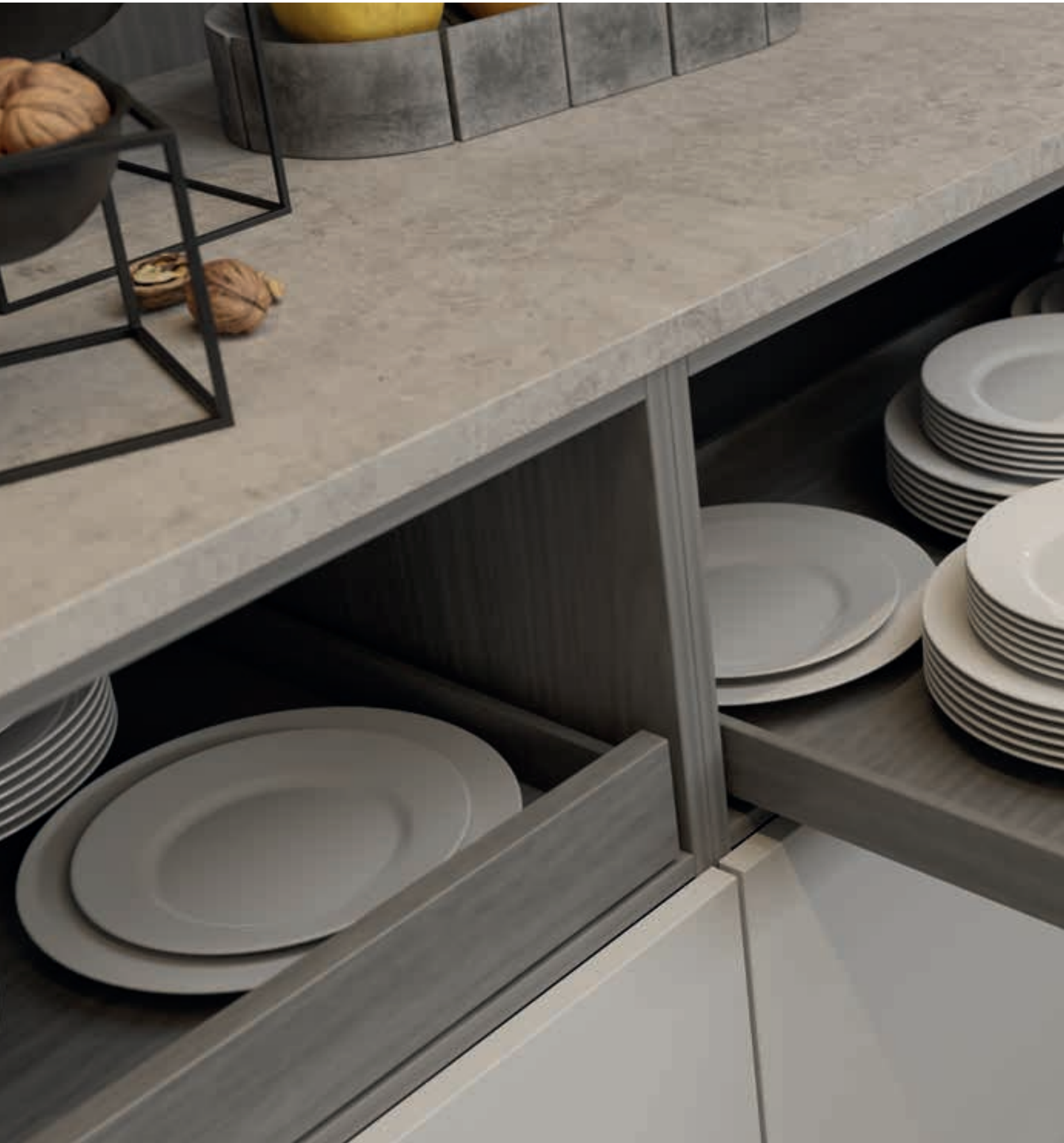
Decorative openings with pull-out trays display their content where easily accessible storage solutions are essential.