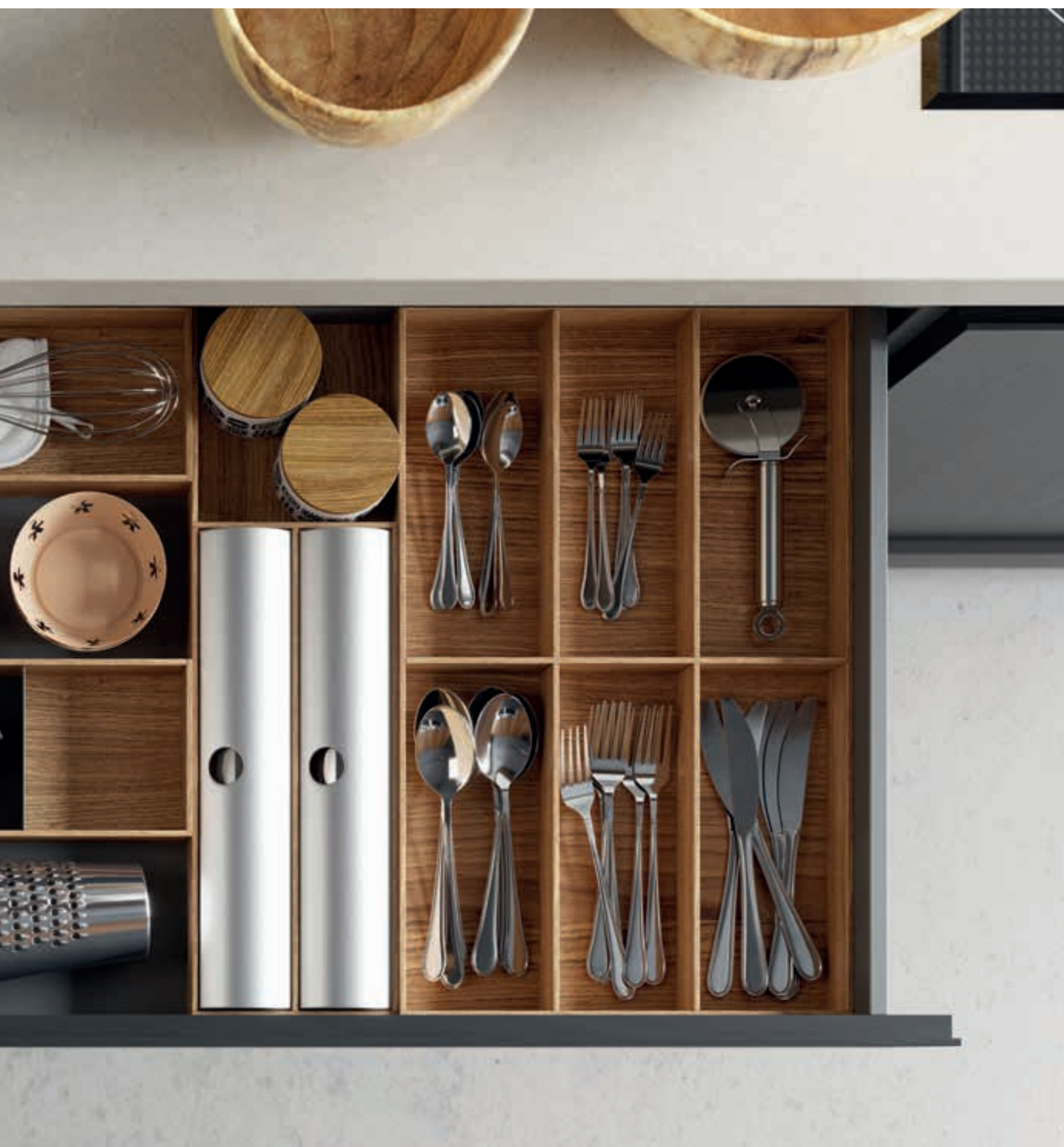
Customizable cutlery and accessories tray. Natural wood finishing and slip-resistant mat are a harmonious combination of beauty and resistance